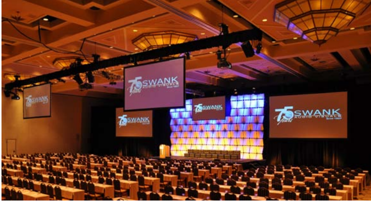
Swank team members utilized wafer panels and five strategically placed screens to ensure that each of the 400+ seats could enjoy an unobstructed view.