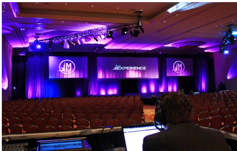
The Doral Golf Resort & Spa Team executed their largest technical production ever with the Harms Software User Group Conference.